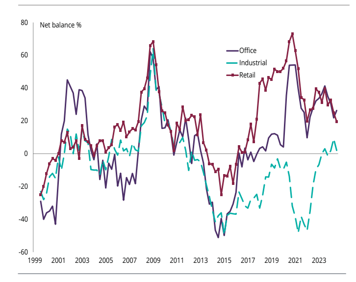
AVAILABILITY - BROKEN DOWN BY SECTOR